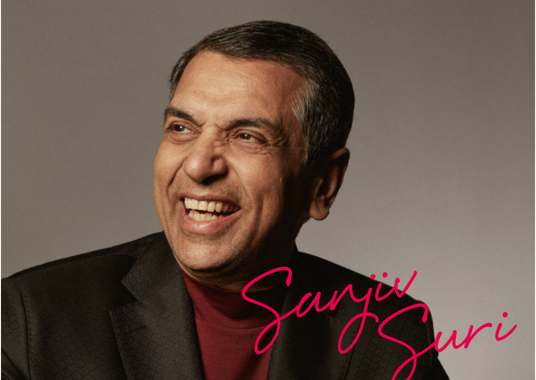
Founding President & CEO of Zátiší Group

Since its foundation in 1991, Zátiší Group has been has grown to include four restaurants, a Europe-wide Zátiší Catering and the Fresh&Tasty healthy daily meals division.