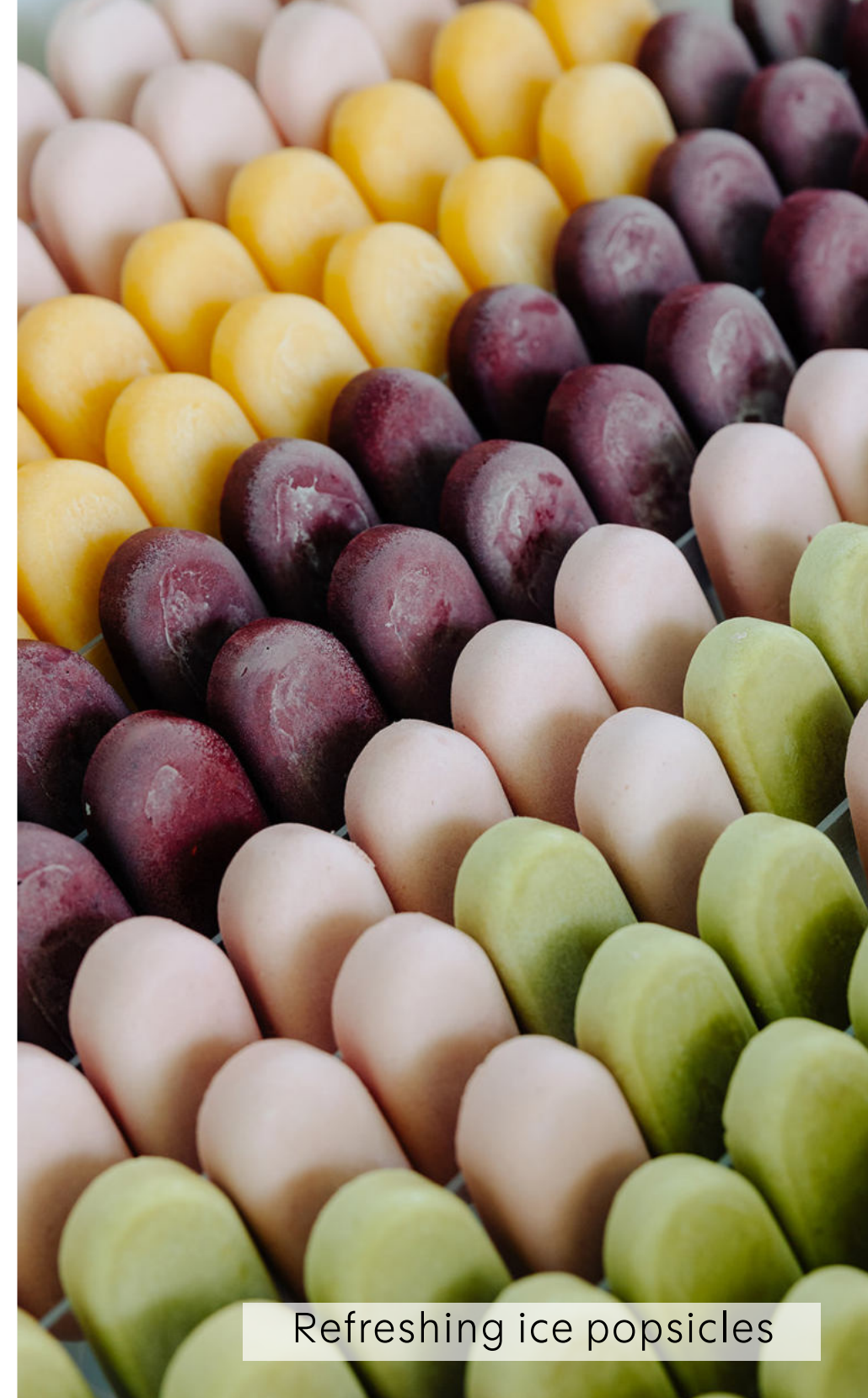
Refreshing ice popsicles