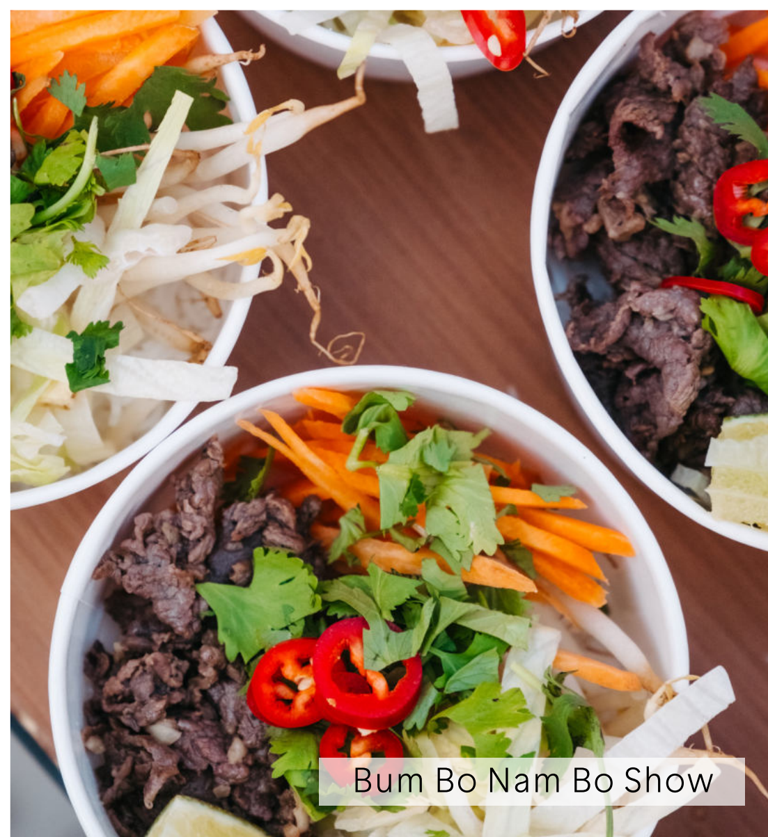
Bum Bo Nam Bo Show