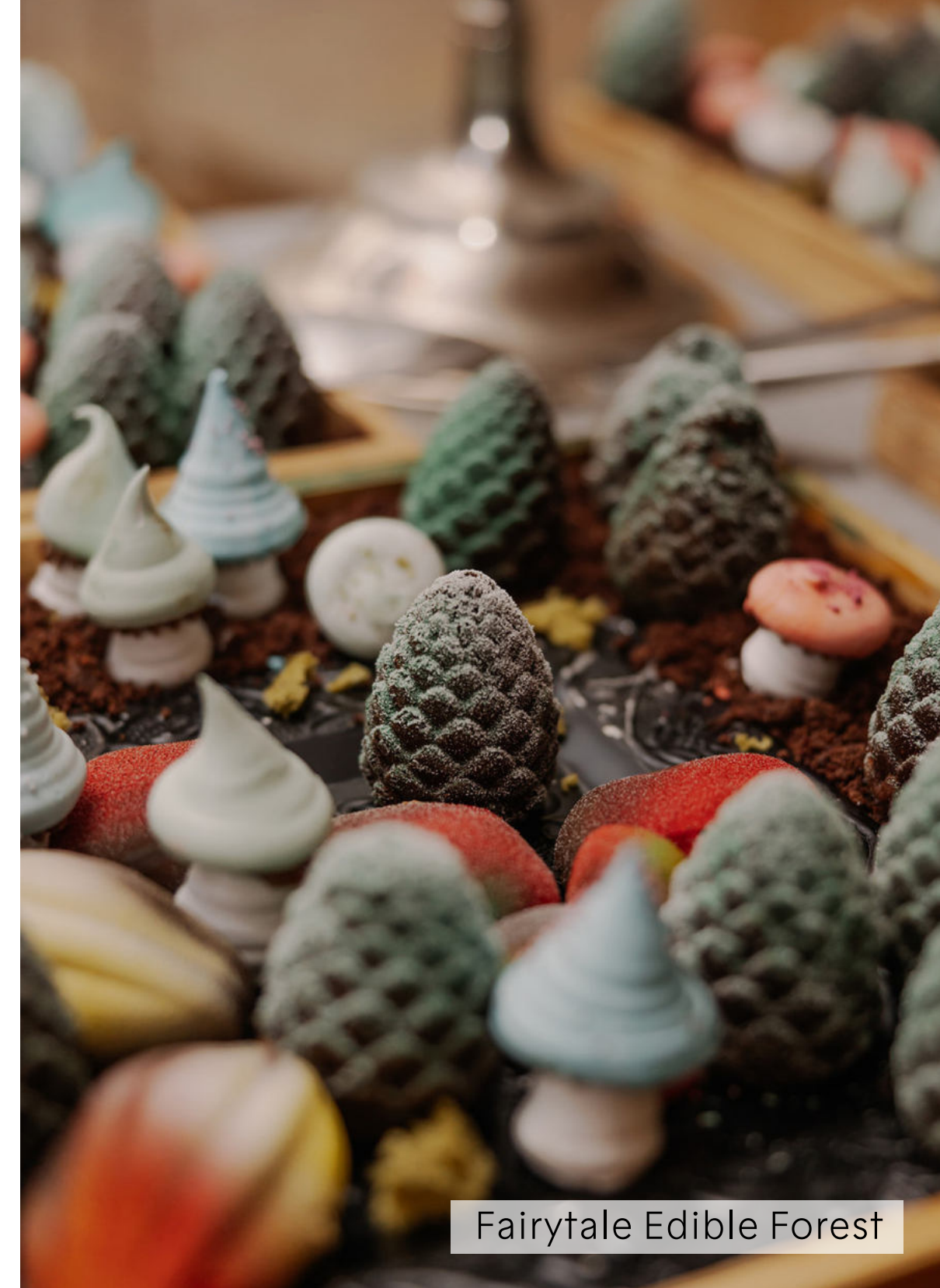
Fairytale Edible Forest