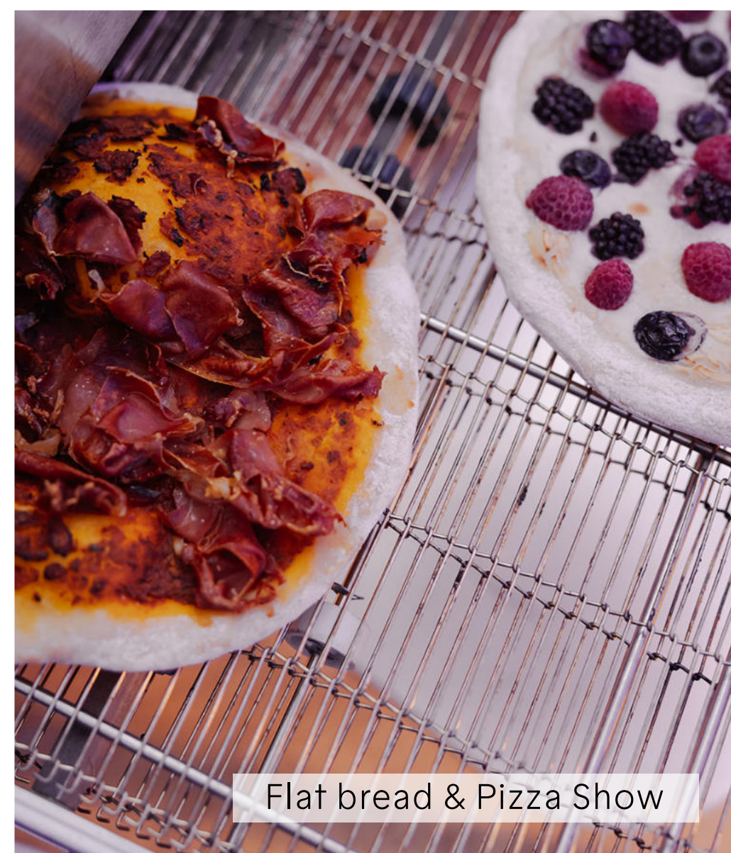
Flat bread & Pizza Show